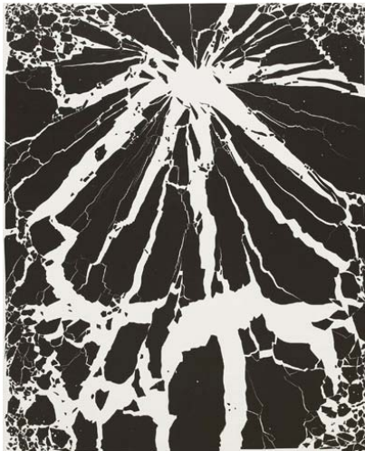
Untitled , 2008, ink on paper, 51-7/8 x 42-5/8"