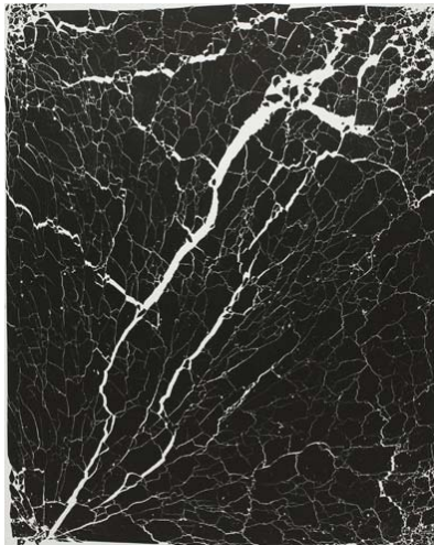
Untitled , 2009, ink on paper, 51-3/4 x 42-1/2"