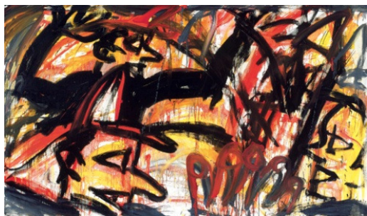
Red Grooms, Painting from "A Play Called Fire" , 1958, collection of Greenville Country Museum of Art, purchase from the Arthur and Holly Magill Fund.

The exhibition will also feature artworks created during and around the performances, including Red Grooms's vibrant Painting from "A Play Called Fire." The painting, on loan from the Greenville County Museum